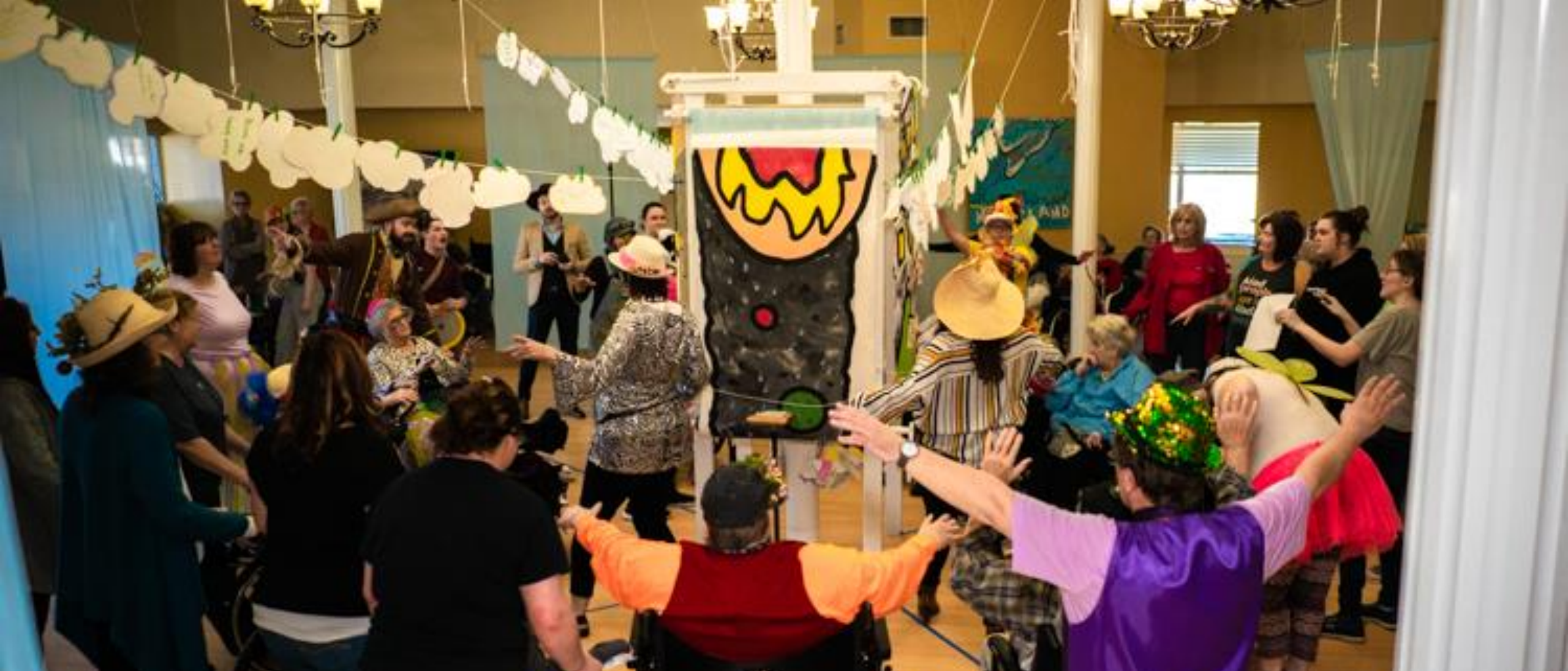
Station Four: Flight School