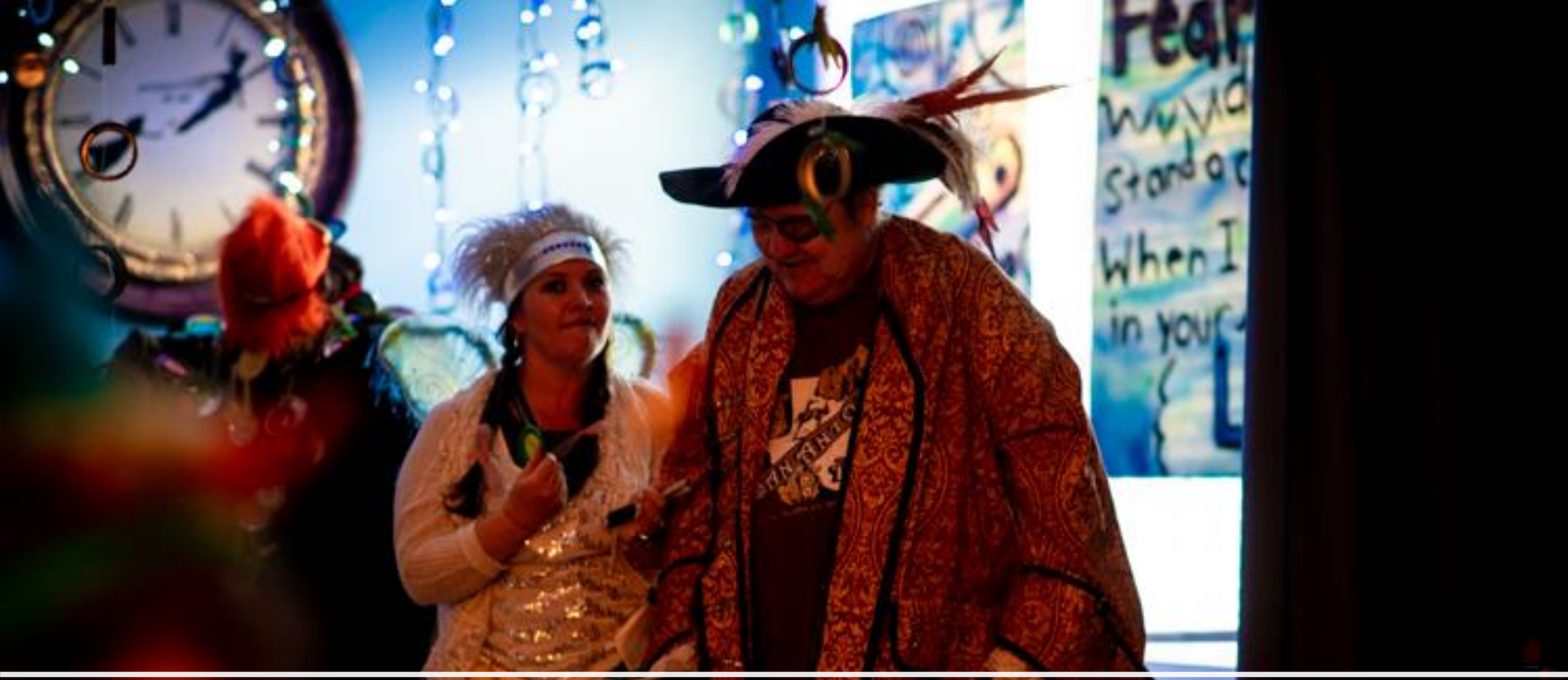
Station Three : Fear Station